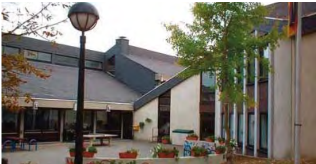
Jugendgastehaus in Oberwesel, Germany, site of the EUU spring 2010 retreat.