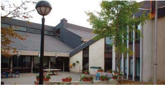
Jugendgastehaus in Oberwesel, Germany, site of the EUU spring 2010 retreat.